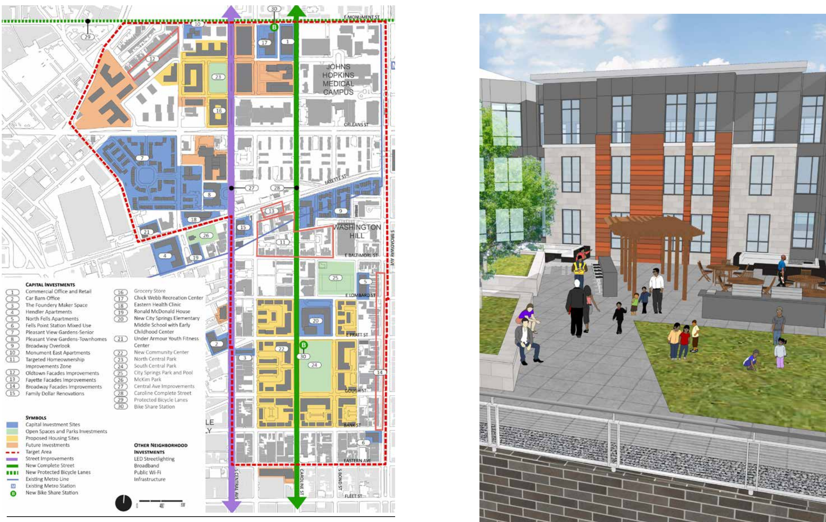
Raised courtyard terrace over parking provides a secure place for residents of all ages to play and relelax