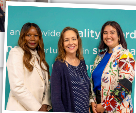
EJP visits the Benton Building

Consultant group, EJP, conducted a visit to the HABC offices to review the progress of each department's involvement in the strategic plan. Meetings were held to reevaluate and develop the next five-year strategic plan for each department.