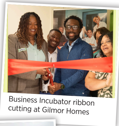
Business Incubator ribbon cutting at Gilmor Homes

HABC collaborated with Innovation Works to open a small business incubator supporting Gilmor Homes residents and residents living in the surrounding areas. These programs include 18-month incubator space, community workshops, and access to Innovation Works' resources.