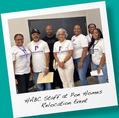
HABC Staff at Poe Homes Relocation Event

The Perkins, Somerset, Old Town (PSO) Transformation Plan continues to move along, as HABC residents attended the open house event at 1234 McElderry to sign their leases and/or update their leasing information. Somerset 2, which is called "The Ella" is due to open in November, and Somerset 3, called "The Ruby" will open this month.