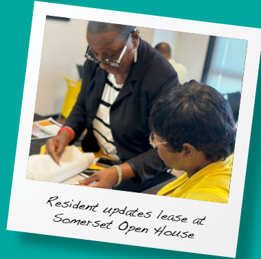
Resident updates lease at Somerset Open House