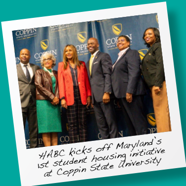
HABC kicks off Maryland's 1st student housing initiative at Coppin State University

Last Fall, HABC conducted a study through an outside source of the agency's compensation structure to ensure that employees' salaries are competitive with the market. Through HUD's requirement, the comp study compared the agency's salary scale with similar organizations within a 50-mile radius and was reviewed by an internal evaluation group. Since September, the salary structure has enhanced flexibility and provides a salary range structure that is set up in 4 groups. Please note, no one was negatively affected by the comp study.