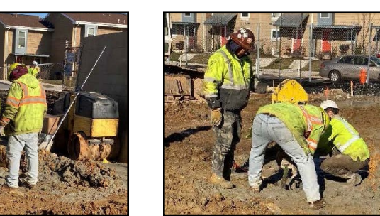
Inserting the steel rebar cage into the pile.