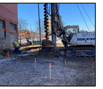
Pumping grout into the pile.