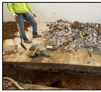
US Pools saw cutting the existing pool floor.