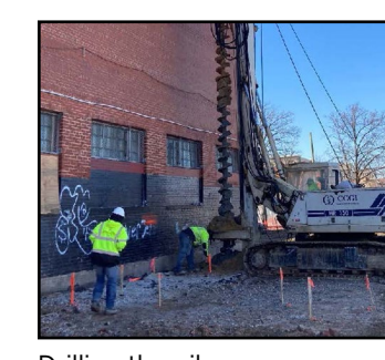
Drilling the pile.