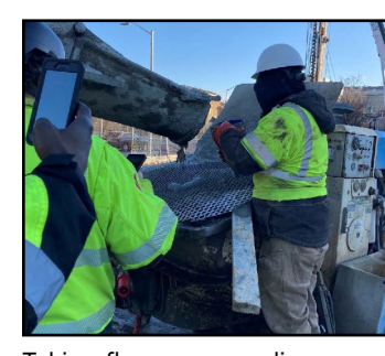
Taking flow cone reading.