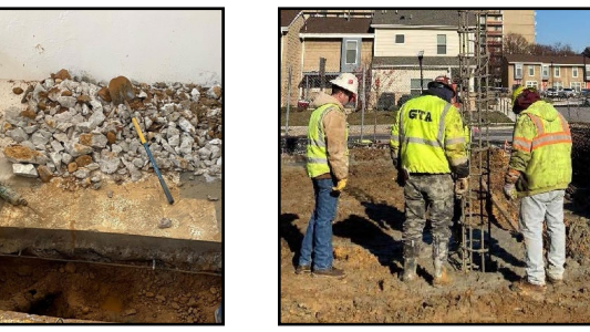
Lowering the steel rebar cage into the ground.