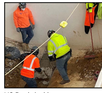
US Pools jackhammer, saw, and cut the existing pool drainpipe.