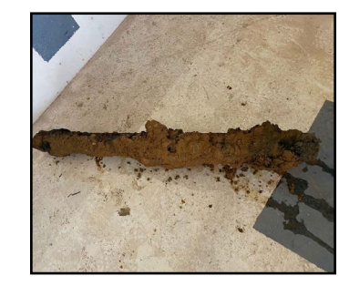
US Pools remove the existing pool drainpipe.