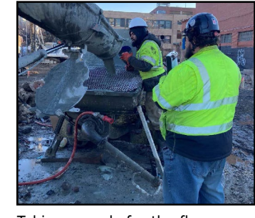
Taking sample for the flow cone.