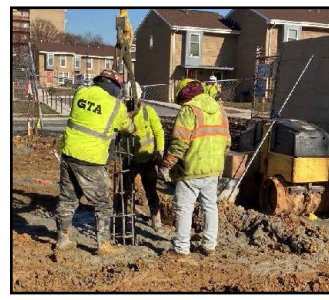
Lowering the steel rebar cage into the pile.