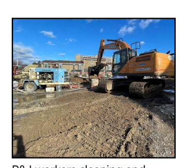
P&J workers cleaning and grabbing the jobsite.