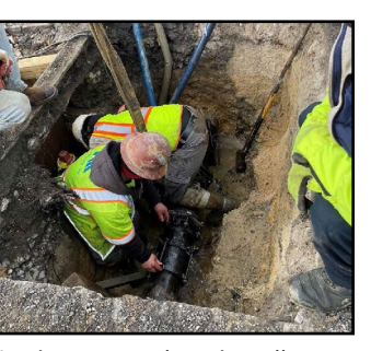
Harrington workers install a 6" water valve.