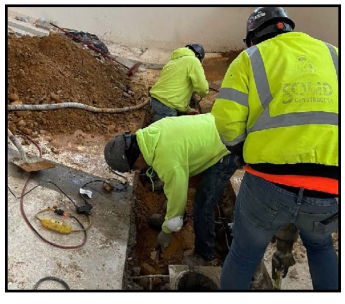
US Pools jackhammer to remove the pool drainpipe