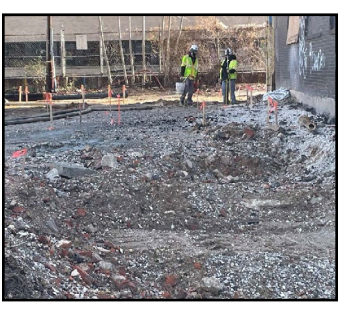
Dewberry workers setup elevation for pile & footing.