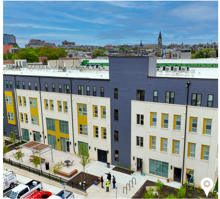
Perkins Square-Phase 1