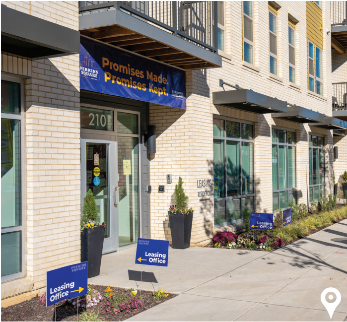
Perkins Square Leasing Office